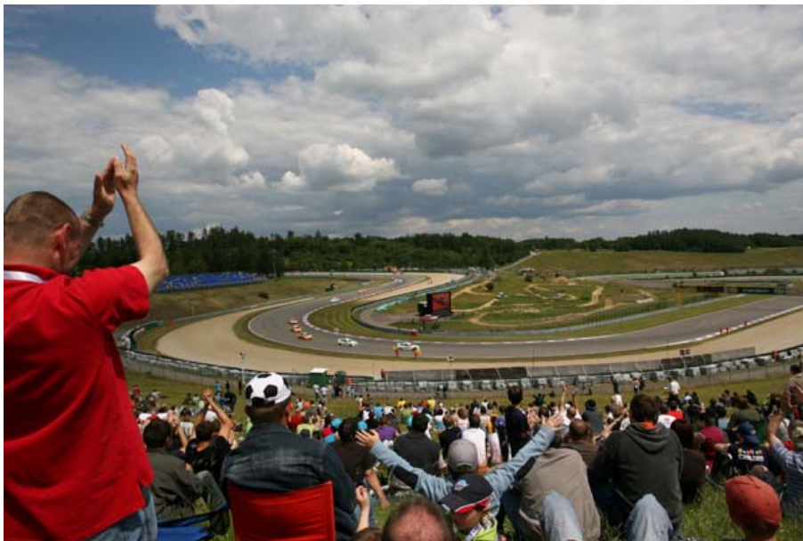
The WTCC returns to Brno for the fifth consecutive year