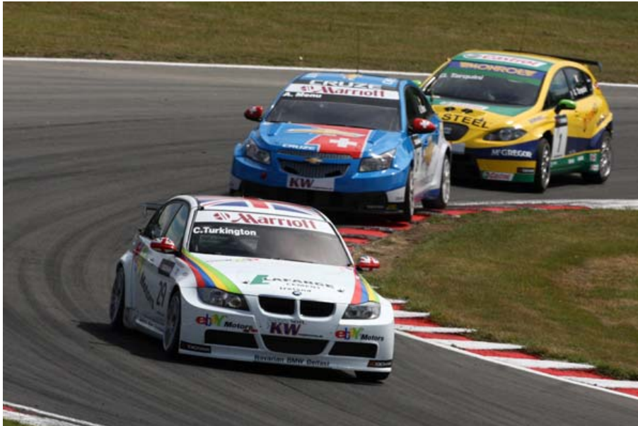
Turkington's performance at Brands Hatch added 10kg to the old BMW cars