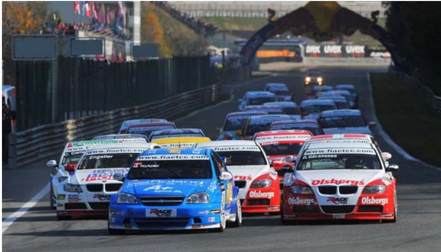
Braga hosts the fifth edition of the FIA European Touring Car Cup