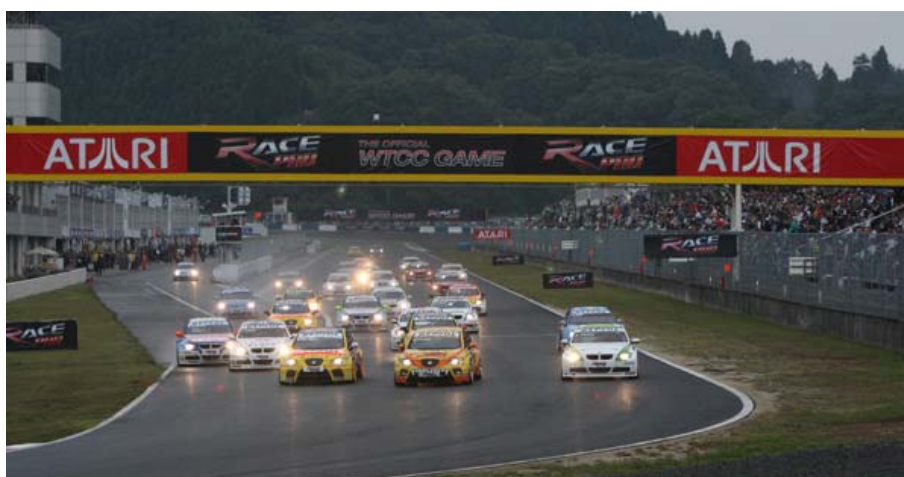
The FIA WTCC returns to Okayama International Circuit next week