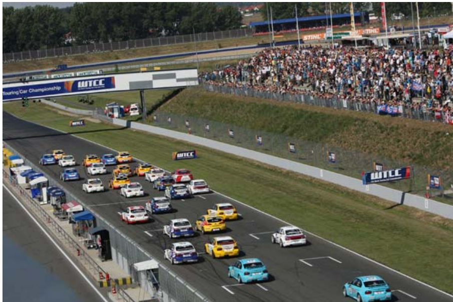
Oschersleben is a traditional venue for the FIA touring cars