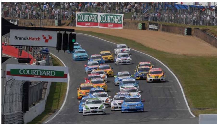
Brands Hatch hosts the FIA WTCC for the fourth consecutive year