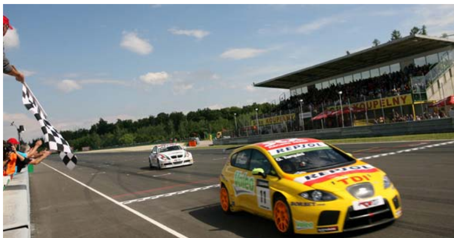
The fight between Tarquini and Zanardi in last year's Race 2 at Brno

Their breathtaking fight was one of the highlights of WTCC's past season.