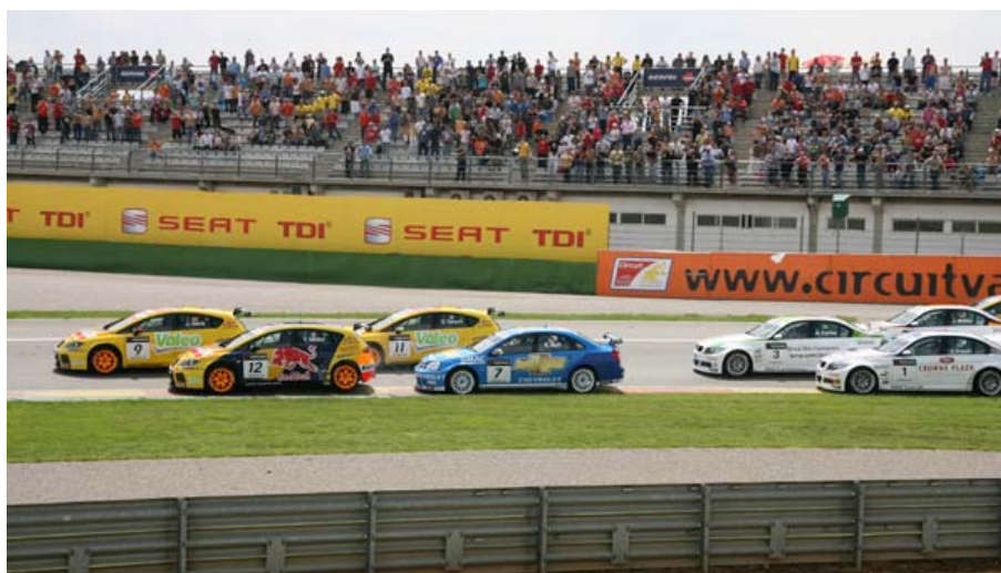
The WTCC cars always attract large crowd in Valencia

Last year the Chevrolet team broke their duck at the Spanish racetrack. Robert Huff, who had been involved in three consecutive first-turn pile ups from 2005 to 2007, charged from fourth on the grid to first under the chequered flag. In Race 2 Alain Menu scored Chevrolet's second win of the day, while his team-mate Huff recovered from eight on the reverse grid to a brilliant second.