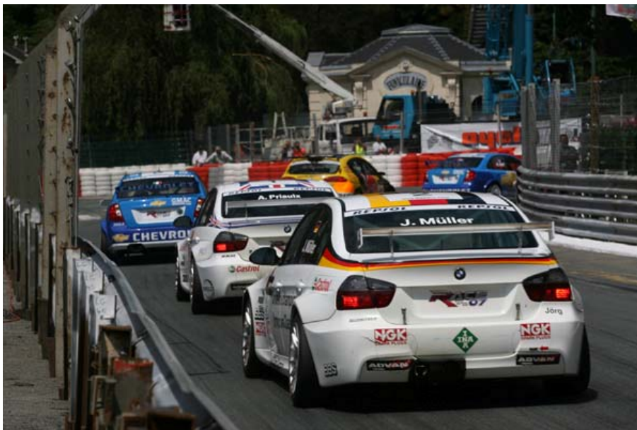
WTCC cars negotiate the Virage de la Gare during last year's event

Like in Marrakech, the competitors will benefit from the street-circuit extended qualifying session. Saturday's usual 30-minute qualifying will last 45 minutes: the 30-minute Q1 and the 15-minute Q2, split by a 5-minute pause.